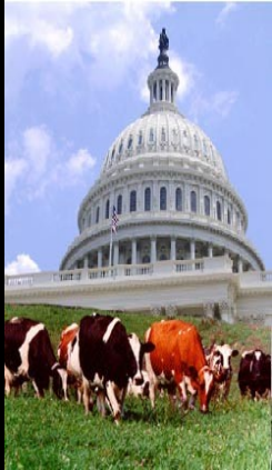
Politics and agriculture do go together